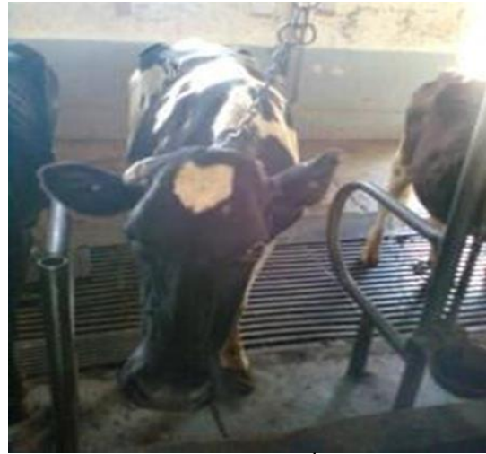
Fig. 2 A Cow during the 5 th week postpartum showed loss of body weight due to ketosis.

BCS of peri-parturient cows showed a significant decrease than heifers during postpartum period (Fig. 4-5 and Table 1).