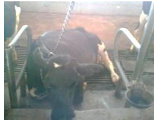
Fig. 3 A recumbent cow during the 1 st week Postpartum showed sternal recumbency due to milk fever.